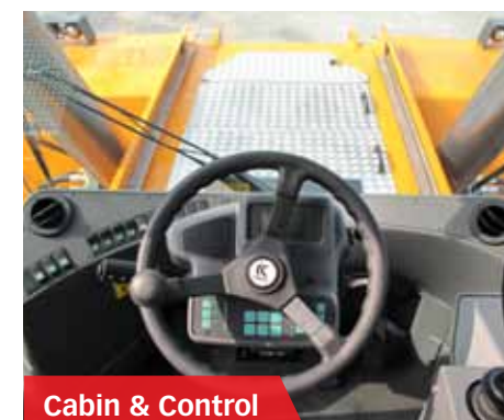
Cabin & Control